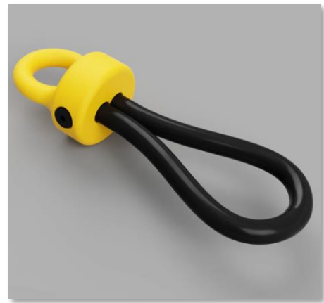
Figure 12 - My DIY Didi monopole electrode that I make and sell

Your imagination is the only limit to how you use conductive rubber, and I have had a lot of fun using it in my DIY electrodes. Conductive Rubber does break down over time, eventually needing to be replaced, unlike metal electrodes.