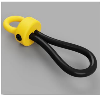
Figure 2 - My Didi Monopole Electrode

The busiest section of my site is most definitely the E-Stim Category 1 where I host all sorts of useful files and information together with guides.