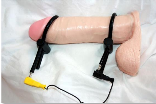
Figure 11 - Two conductive rubber cock loops around a penis

I suggest shaving the area where they are going to be used to help get a good electrical contact and as it helps when you peel it off after your e-stim session.