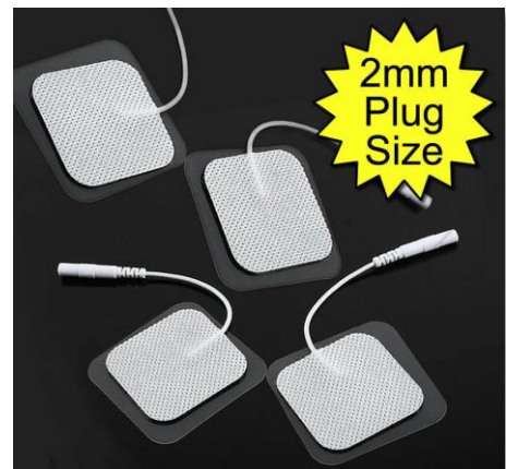
Figure 10 - Self-adhesive monopole electrodes are incredibly versatile

You can also gently wash the sticky face to get rid of dead skin cells, allowing it to dry before placing it back on its plastic backing. This can be done several times to extend their life.