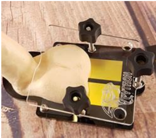
Figure 15 - The Python Compression System Bipolar Electrode

Bipolar electrodes are not just for internal stimulation though, there are a wealth of different designs available to try.