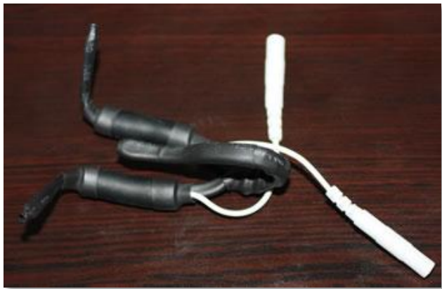
Figure 17 - My DIY Clitrode was a lot of fun to make but using it is much more enjoyable

I enjoy using bipolar electrodes so much due to their simplicity and the way I can quickly wire myself up for some fun. I love coming up with new idea for them.