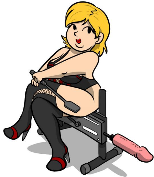
Figure 1 - Joanne, yes, it's a pretty good likeness.