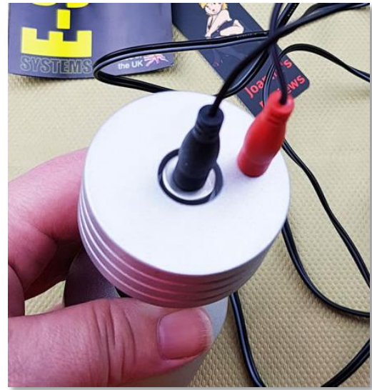
Figure 14 - Two plugs from the same cable/channel plugged into a bipolar electrode

Bipolar electrodes can be combined with other electrodes by just using one of the sockets in them to target specific internal areas such as the g-spot or prostate.