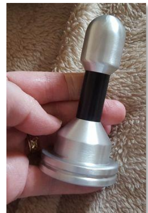
Figure 18 - The Flange bipolar electrode