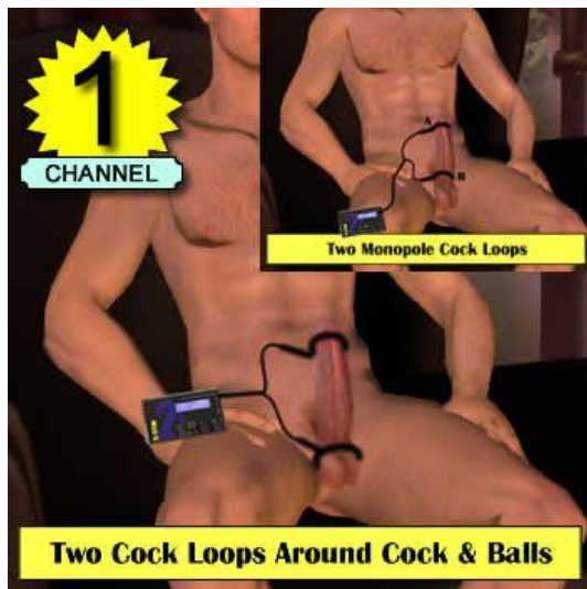
Figure 23 - Two monopole cock loops

There are so many ways that you can enjoy e-stim as a cock owner and here are some of the basic ones.