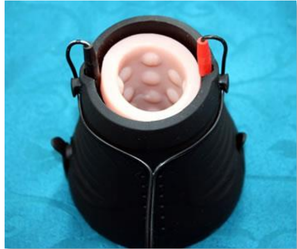
Figure 16 - The Jack Socket is a very popular e-stim male masturbation sleeve

There are a huge number of different ones available and I have only just barely touched on the different designs. Have fun with them and if you want to make your own then that can be very rewarding.