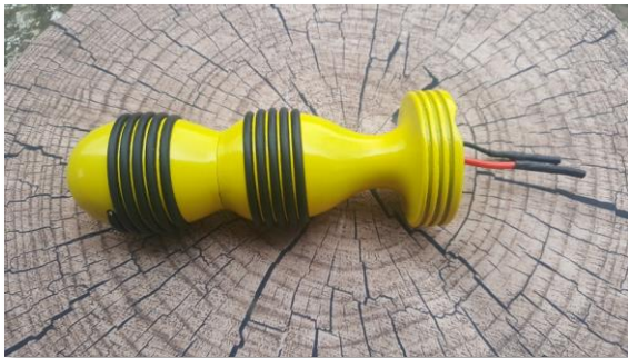
Figure 5 - Conductive rubber on one of my home made insertable electrodes

Galvanized steel and other metals should also not be considered safe for stimulating.