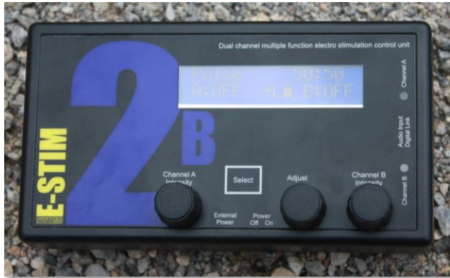
Figure 9 - An advanced e-stim control box, the 2B from E-Stim Systems

Often made for play boxes will have multiple routines in them that provide vastly different feelings, and it is fun to experiment with them.