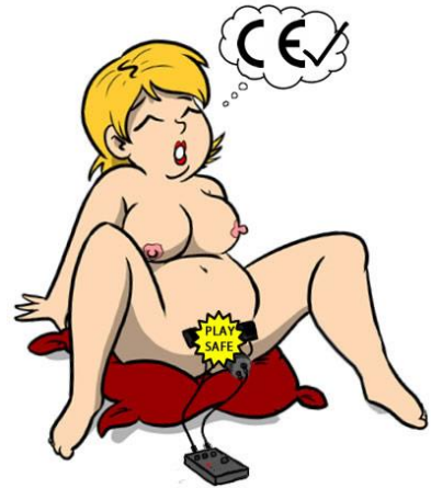
Figure 3 - Always use safe equipment when you play

Each plug flicks from positive to negative multiple times each second.