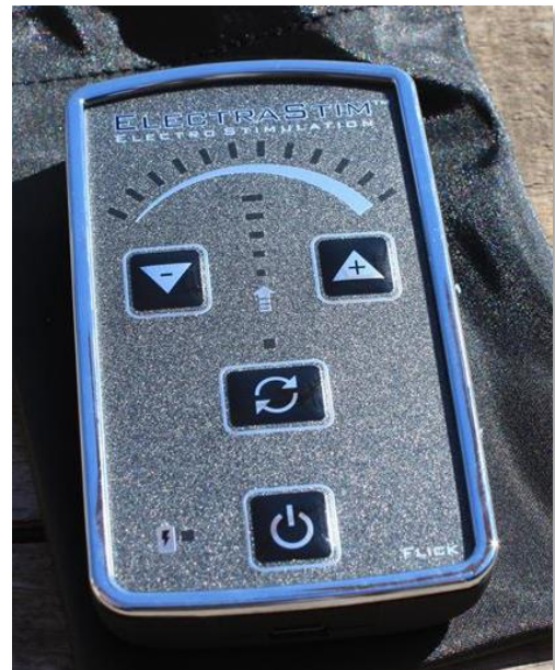
Figure 8 - The EM60 Flick entry level control box from Electrastim

Control boxes are available for all budgets with the more expensive ones having some fantastic features such as upgradeability and being able to be controlled from afar over the internet.