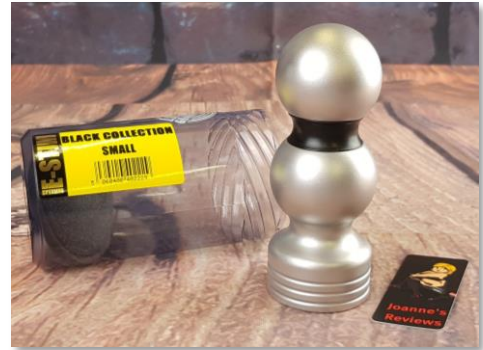
Figure 4 - A commercially available electrode from the Black Collection made from aluminium by E-Stim Systems